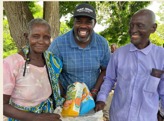
These pastors came for Bible training and were surprised and extremely grateful to go home with food and clothing.

Many of the people pictured on this page are missionaries from some really tough neighborhoods near the Somalia border. These photos were taken at a September leadership conference hosted by Peter and funded by Kainos. Each pastor and missionary was given a copy of Face to Face to use as devotional and teaching content for their congregations along with food, clothing, and Bibles!