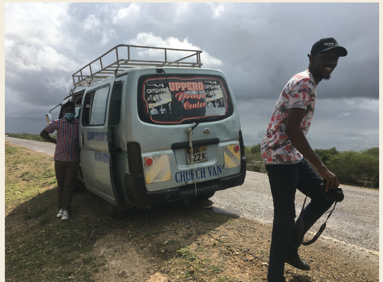
This faithful van has served our team well for many years, but recent mechanical issues put it in the shop (probably indefinitely). It is time for an upgrade so we can get back to reaching the remote areas for Jesus.